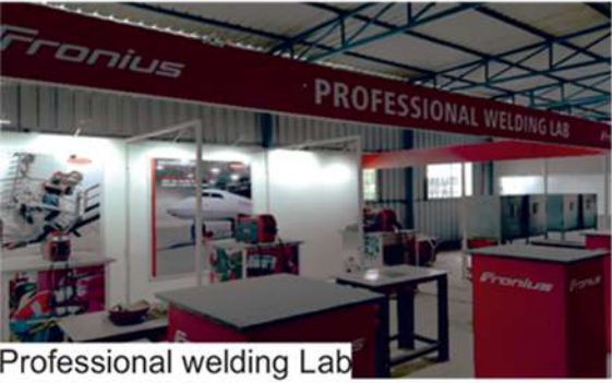
Professional welding Lab