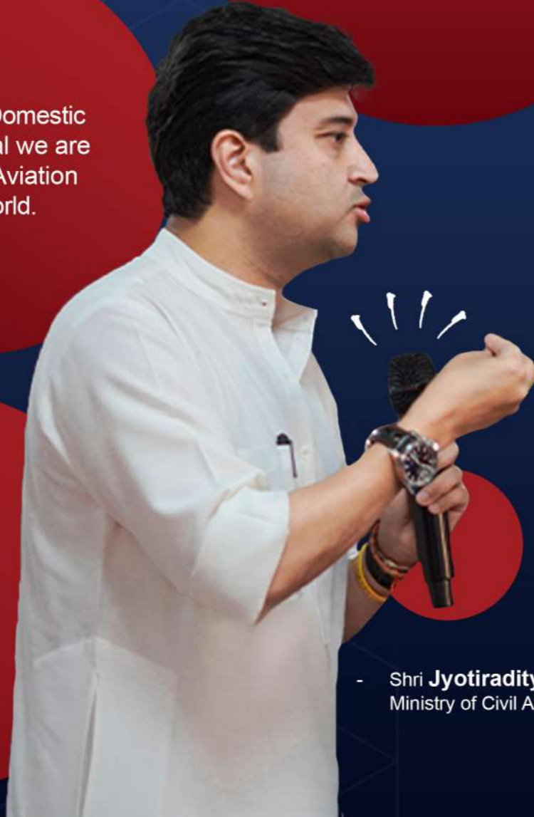
- Shri Jyotiraditya M. Scindia. Ministry of Civil Aviation

Due to the rapid growth and usage of drone technology in various sectors the demand of the drone pilots will be increased in the near future.